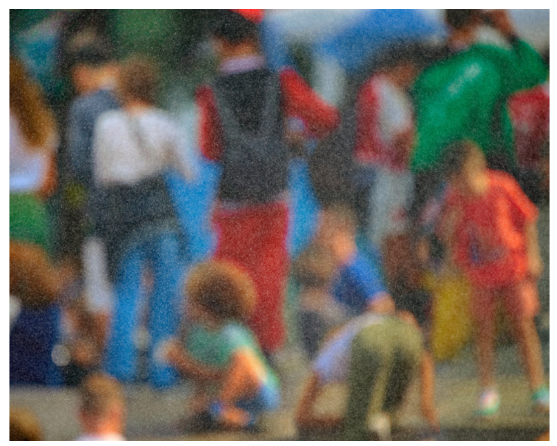
Fountains #03, 2024

Academy Summer Exhibition in 2022 and 2023.