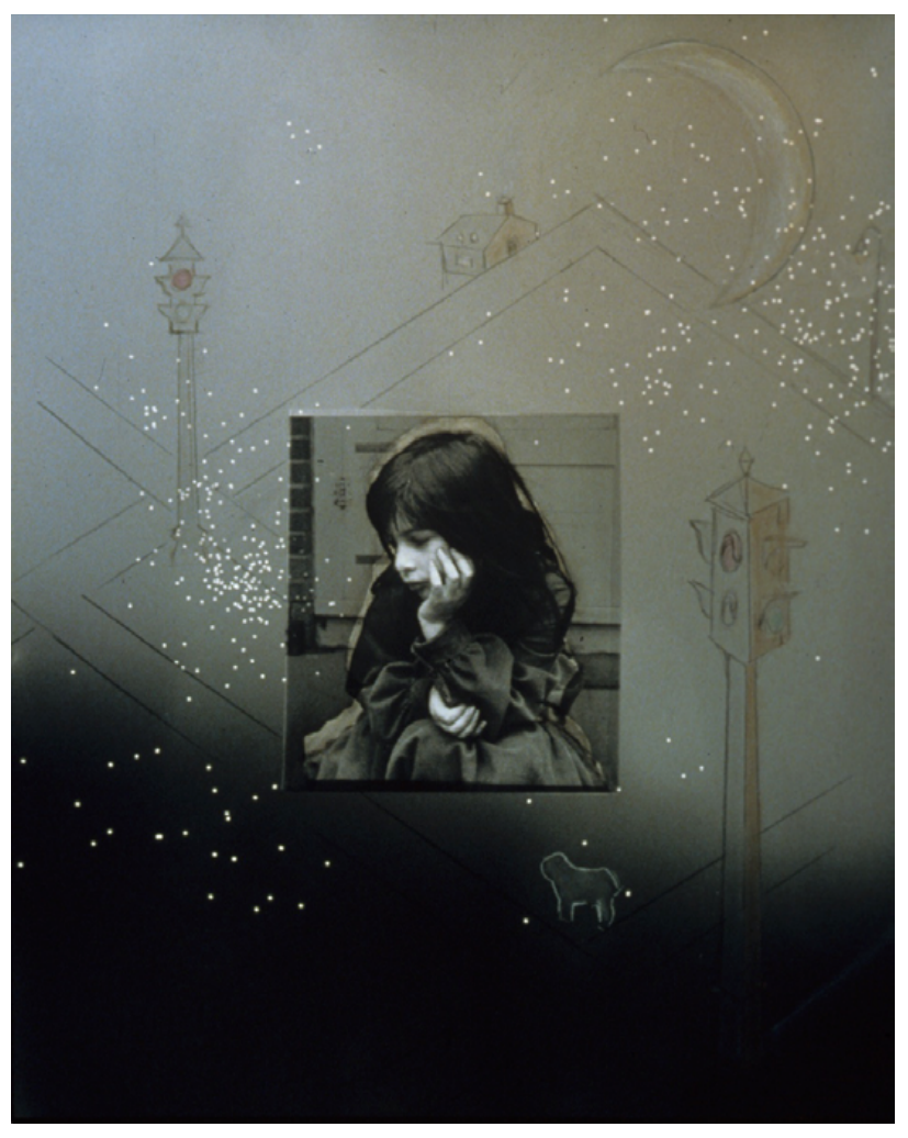
Julia and the Window of Vulnerability (Variation with Lamppost) 1983

and the political and social unrest of the time. The works on display offer an unfiltered glimpse into life as she experienced it. Her early collages, incorporating found imagery, handwritten text, and layered textures, reflect an experimental approach which challenges conventional artistic boundaries.