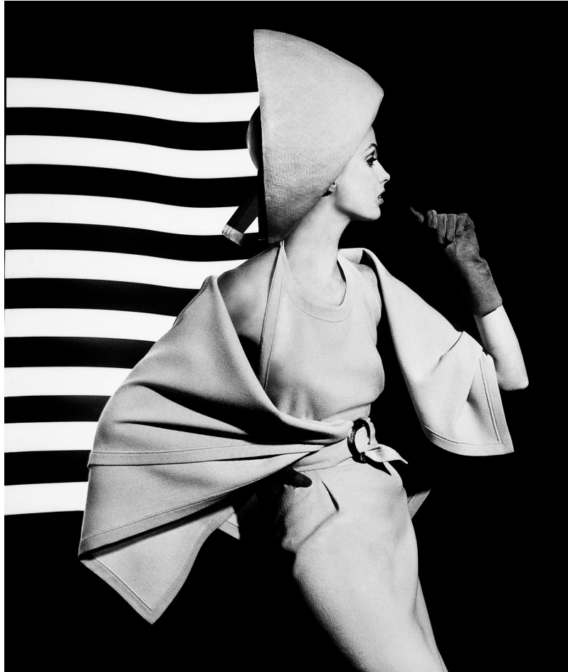
Dorothy + white light stripe , 1962

Following his years at Vogue , Klein returned increasingly to filmmaking and street photography, using his deliberately grainy, blurred aesthetic and wide-angle lens to capture the energy and contradictions of urban life. The exhibition traces these connections across decades of work, from the experimental abstractions of the 1950s to the monumental painted contact sheets of his later years, in which enlarged and overpainted frames transform iconic images into dynamic works in their own right.